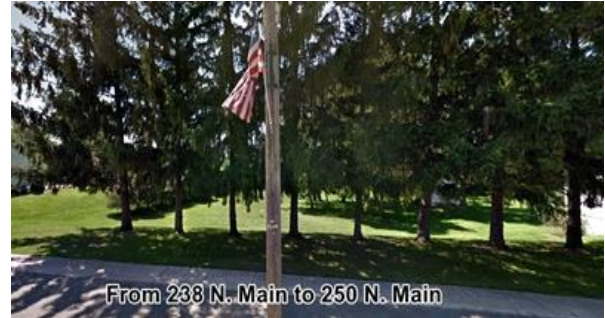
From 238 N. Main to 250 N. Main