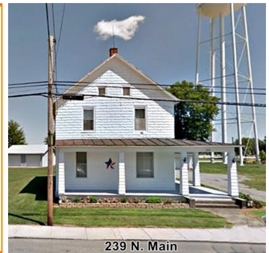
239 N. Main