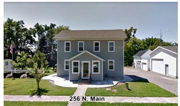
256 N. Main